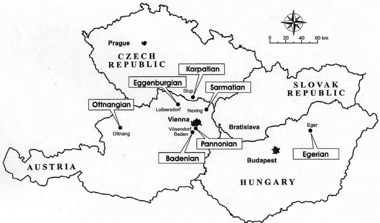
FIGURE 2 Geographic distribution of all Miocene stratotype localities of Central Paratethys stages.

palmatum and Gigantopecten holgeri going along with the extinction of the Eggenburgian endemics such as Oopecten gigas and Laevicardium kuebecki (Mandic and Steininger 2003). Another important immigration is represented by the fossil sea cow Metaxytherium krahuletzii being conspicuously common in the upper Eggenburgian but absent in older horizons. All that happens distinctly prior to the onset of the warm-temperate carbonate production on top of upper Eggenburgian siliciclastics (Roetzel et al. 1999). The onset of the warm-temperate carbonate factory is probably coeval with the slight cooling indicated by Zachos et al. (2001) and by the MBI-2 isotope event of Abreu and Haddad (1998) (Fig. 1). The loss of tropical mollusc taxa between the middle and the upper Eggenburgian could coincide with the MBI-1 isotope event.